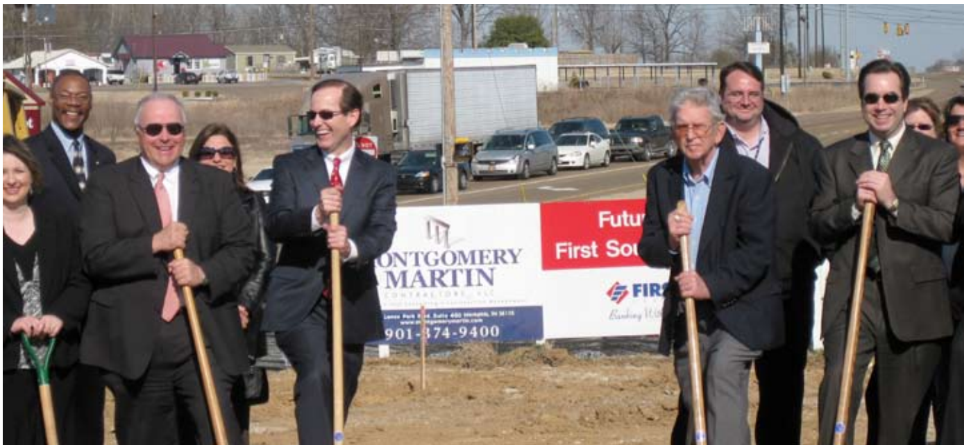
Members of First South's senior management team along with local dignitaries from Atoka and Tipton County break ground on the credit union's new location in Atoka, Tennessee.

To find out more about how we can help you and your children, please call us at 901.380.7400, go online to firstsouth.com or drop by any one of our 13 locations. We'll be happy to help!